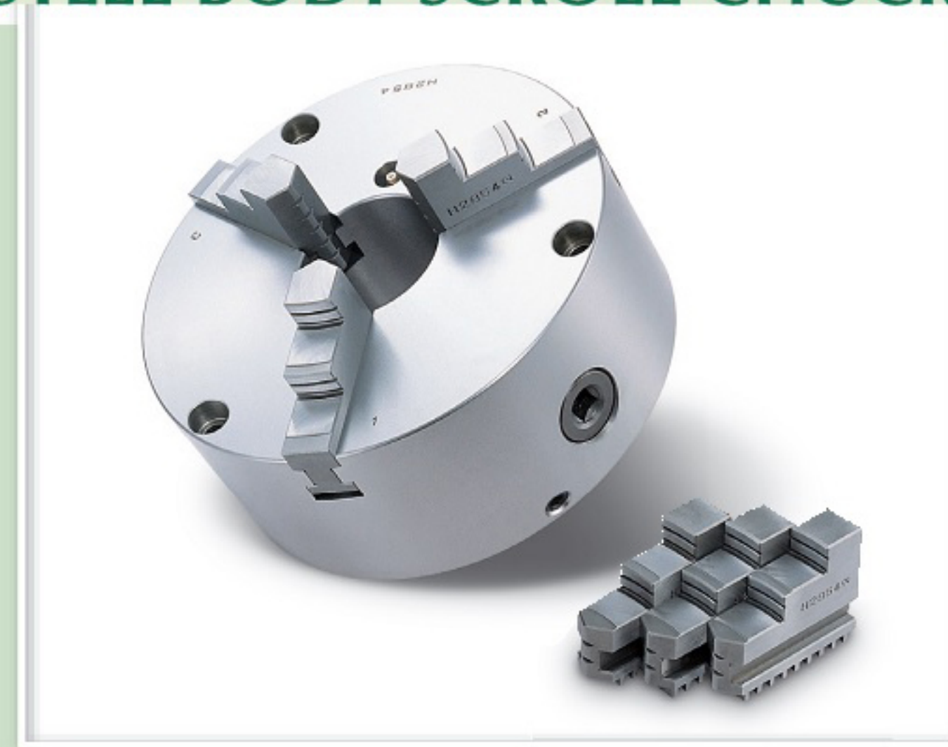
規格表 » Specifications